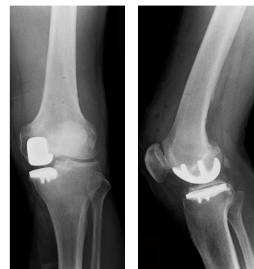
JOURNEY UNI Knee Replacement supported with the NAVIO Surgical System